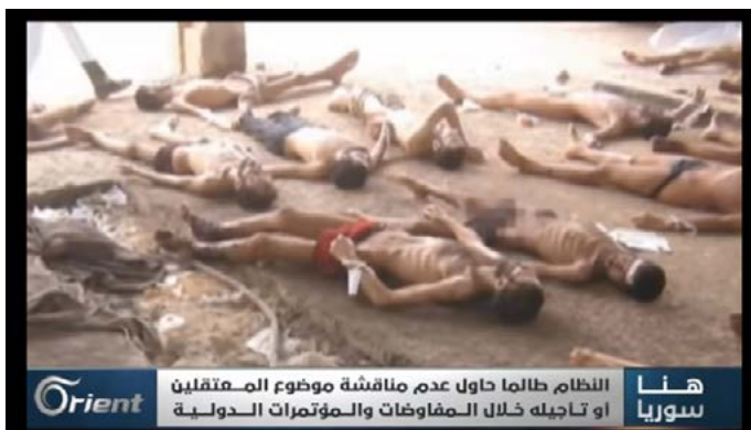
Still from an Orient News video report which discusses the release of prisoners by the Syrian government

Orient TV relies heavily on archived footage. The outlet shows photos from the Cesar Photograph Collection - portraying atrocities committed against government-held detainees - without indicating that these images are unrelated to the event.