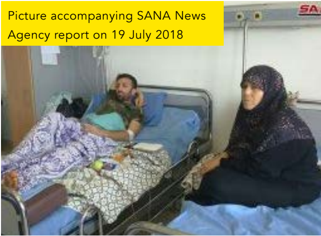
Picture accompanying SANA News Agency report on 19 July 2018

presents emotive stories of the suffering of the inhabitants during the siege. The government is also portrayed very positively, mainly by presenting the follow-up to the evacuation from a humanitarian angle. SANA, for instance, aired many images of village inhabitants receiving humanitarian aid or medical care in hospitals.