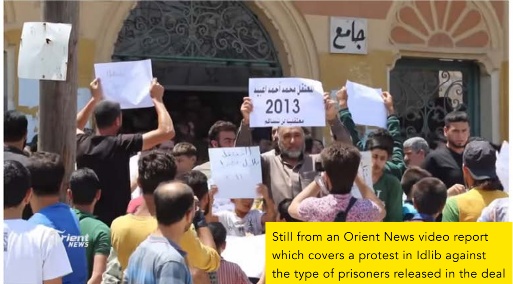
Still from an Orient News video report which covers a protest in Idlib against the type of prisoners released in the deal

trend of presenting Syria solely as sovereign state.