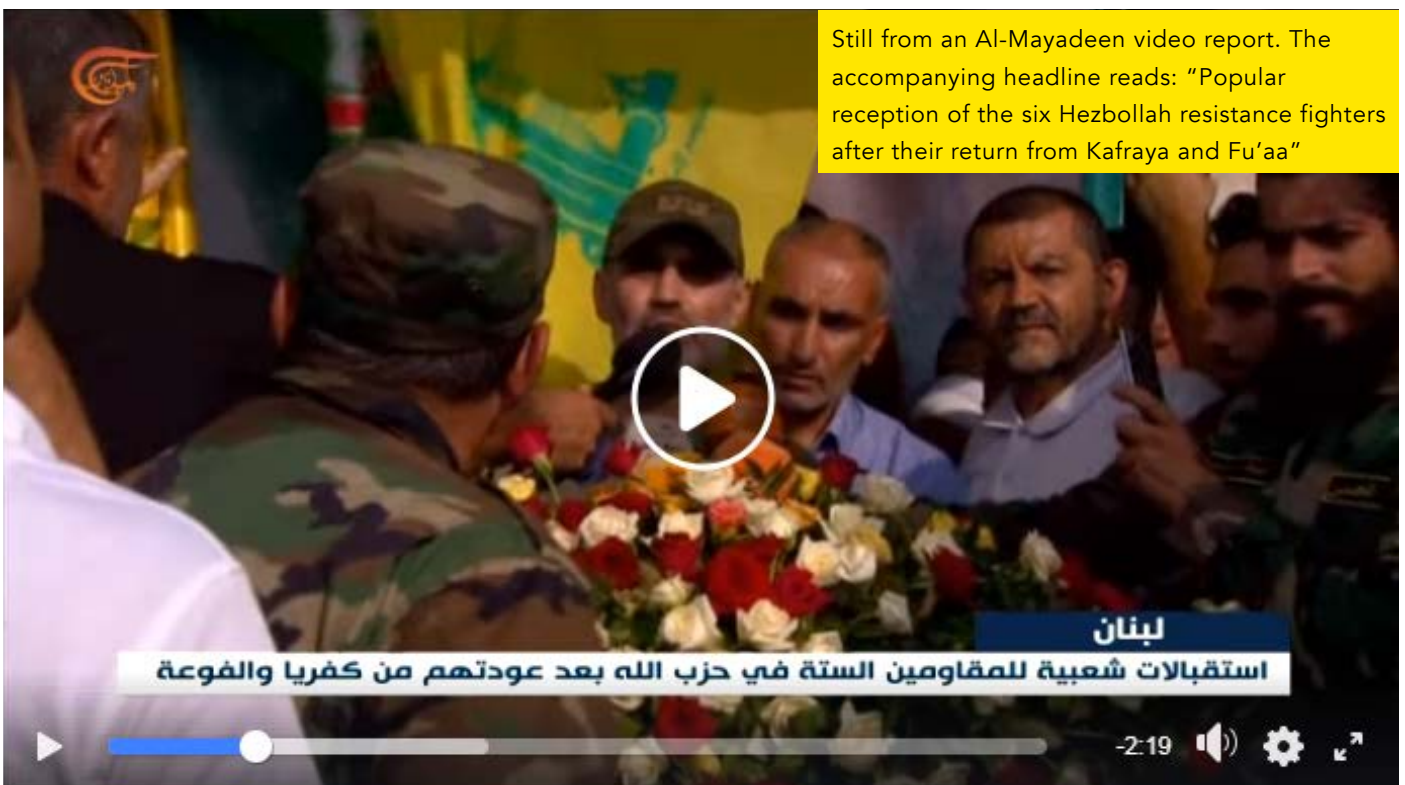
Still from an Al-Mayadeen video report. The accompanying headline reads: "Popular reception of the six Hezbollah resistance fighters after their return from Kafraya and Fu'aa"

Pro-government partisan media reports are also consistently similar in their avoidance of particular frames and aspects of the story. Sectarian affiliations of the actors involved in the evacuation of the two villages are not mentioned. This is in line with the Syrian government's portrayal of itself as a protector of minorities in the country. Also, foreign influence is downplayed to emphasise the sovereignty of the Syrian state. An exception to these trends is the reporting of Al-Mayadeen. The Lebanese based television channel emphasises the heroic role of Hezbollah, deviating from the